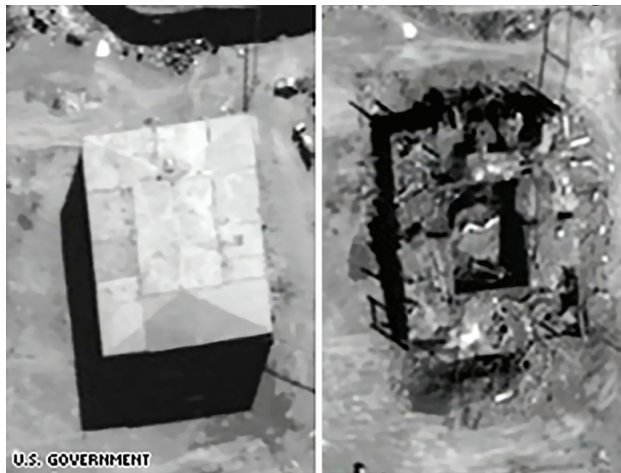
Before and after picture of building struck during Operation Orchard in Syria

As knowledge of Al-Kibar spread, Israeli officials were concerned about a leak, which could alert Syria, so they acted quickly. The air raid on Al-Kibar on the night of September 5/6 was disguised initially as an exercise over the Mediterranean. Some of the scrambled Israeli Air Force jets returned to base. The eight Operation Orchard 33 aircraft flew north. One report indicates that they eliminated a radar station enroute. 34 Aircraft imagery of the results showed a total destruction of the Cube. "Ten North Korean nuclear engineers reportedly were killed in that raid." 35 Some reports indicated three dozen may have been killed. 36