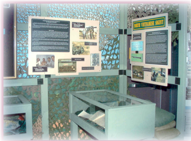
The Vietnam War Exhibit (at left)